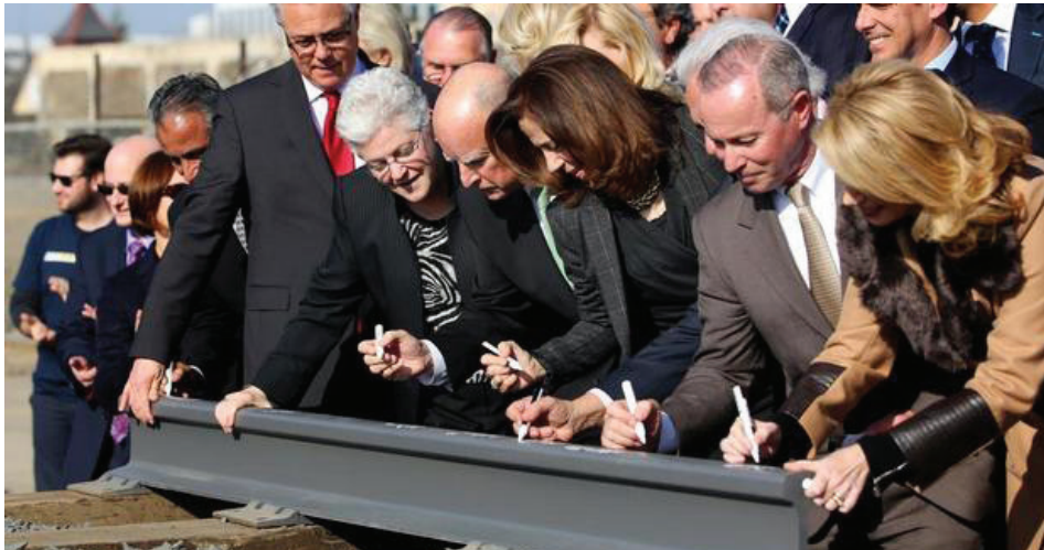
Gov. Jerry Brown, fifth from right, joins dignitaries at the January ceremonial groundbreaking in Fresno for California's high-speed rail project.